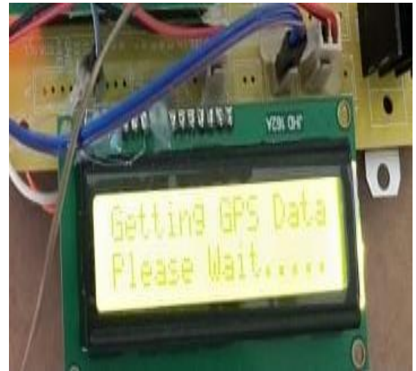
Figure.2: Transmitting Section