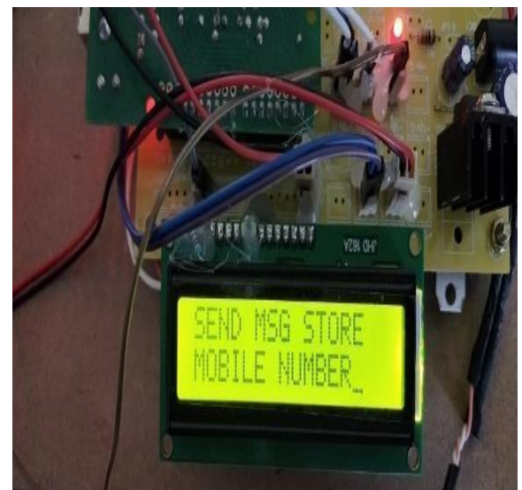
Figure.3: Receiving Section