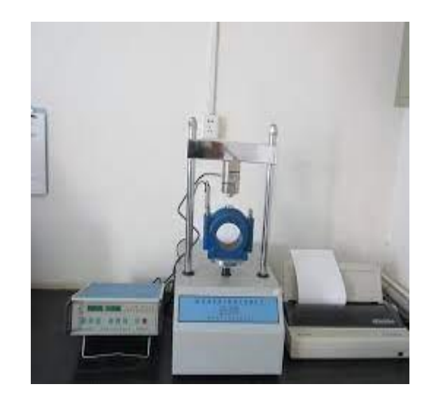
Fig 1 Marshall testing Machine

The test was conducted as the prescribed format per ASTM D-06 procedure.