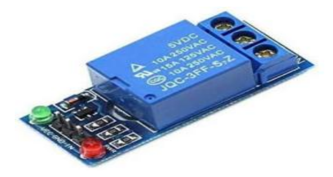
Figure 5.4 Relay

A Relay is an electromechanical device that can be used to make or break an electrical connection. It consists of a flexible moving mechanical part which can be controlled electronically through an electromagnet, basically, a relay is just like a mechanical switch but you can control it with an electronic signal instead of manually turning it on or off.