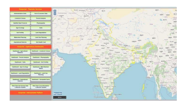
Fig -2: Homepage for Proposed Geoportal System