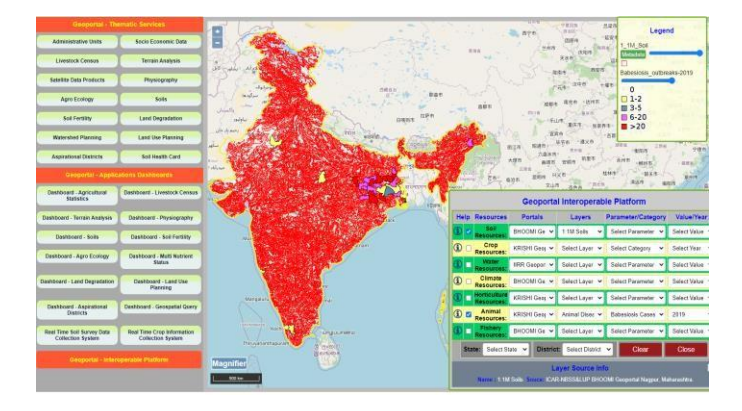
Fig -3: Interoperable Geoportal Platform

Fig - 1 shows a flow diagram to build the proposed Geoportal. This will illustrate how the data will be collected and processed, published and Geoportal is developed. Fig -2 shows the homepage for the proposed Geoportal. This homepage shows User Interface for Geoportal which has different services and applications. Finally Fig - 3 shows how Interoperable Platform Concept works. This platform can collect different layers from different Geoportals such as BHOOMI Geoportal, KRISHI Geoportal, and IIRR Geoportal located at different institutes. These all institutes have their Geoservers which are located in their organizations and have their controls. With the help of APIs, data is fetched from these Geoportals in the form of WMS or WFS Services and is shown on a single platform. The data is shown in the form of a map. This data is for viewing and analyzing purposes. Data might be shared or allowed to download by providing authentications depending on the policies of the data owner or institutes. Data security concepts would also be implemented to secure the data from hackers or other threats.