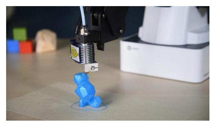
Figure 4. Cool 3D printing robotic arm [7]

Stacking is mainly done at industries for packaging purpose. It can also be very useful at the warehouses and also in arranging the transportable containers.