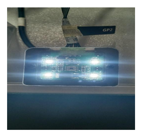
Figure 2. A colour sensor

As seen in figure 2, the colour sensor is utilized to determine an object's colour. It determines the RGB color's light intensity and outputs a result in accordance. It includes an inbuilt IR blocking filter that accurately detects colour. The colour sensor has four analogue to digital converters.