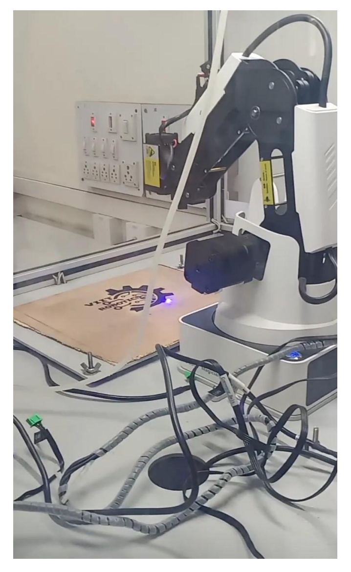
Figure 6. Laser engraving on wooden plank

Figure 6 shows a dobot engraving my department logo on a wooden plank. [9] Drawing and laser engraving both use the same graphical user interface. Adjust the zero point and direct the laser beam towards the desired material while laser engraving for the first time. Zero point adjustment refers to aligning the laser nozzle's end effector with the surface of the work item being engraved. In essence, the zero point does not have zero value since it makes sure the laser nozzle only contacts the target surface.