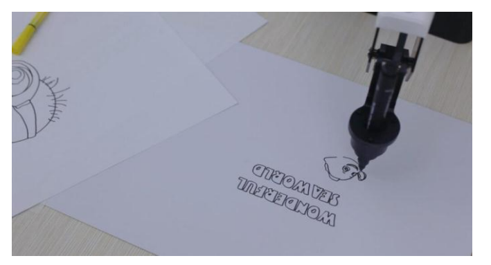
Figure 5. Robot arm Writing and Drawing using a pen [7]

Because of its exceptional precision and stability, the Dobot Magician can draw smooth lines. Customized artwork may be sent into Dobot's software to be translated to code and then drawn on paper by the arm. Similar settings can also be used for custom text. It may be a great ally for creatives. A robot arm can also be used for calligraphy, portraits, and much more.