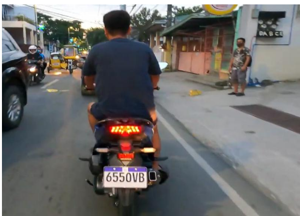
Figure 3; Input Video