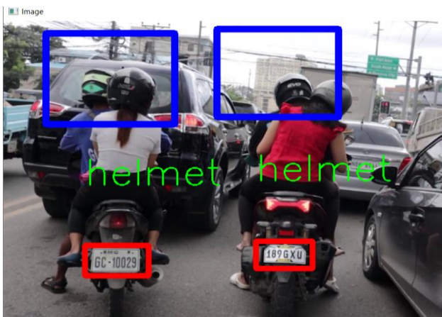
Figure 2: Input Video After Analysis