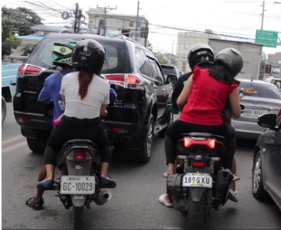
Figure 1: Input Video