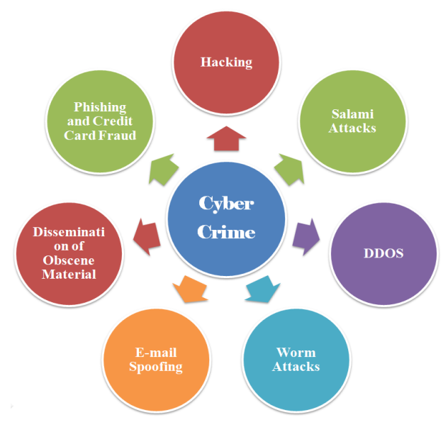
Fig -1: Forms of Cybercrime

Cybercrime has many forms and new forms and techniques are being noticed day by day. However, the main forms of cyber crime are attached below: