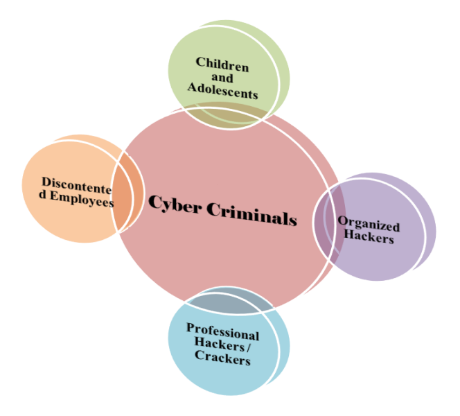
Fig -2: Forms of Cyber Criminals

Cybercriminals are an ever-present threat in every country connected to the Internet. Cyber criminals consist of different groups or categories as shown below: