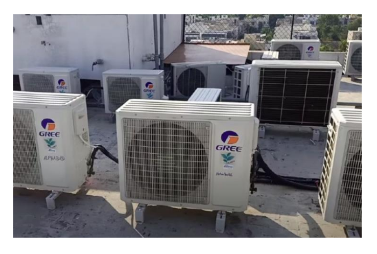
Fig:2 A residential terrace loaded with AC units Table 2: Live Load / Imposed loads as per various codes.