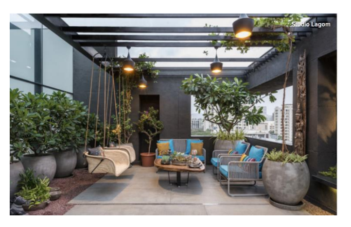
Fig:1 A residential terrace loaded with planters and furniture

A planter-filled residential patio with furniture is shown in Fig.1. A residential terrace brimming with air conditioning units is shown in Fig.2. Imposed loads and live loads according to various codes are shown in Table2.