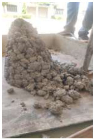
Fig.12 Slump Test

The slump inspection, which evaluates the evenness and workability of newly poured concrete, is a straightforward and prevalent process. It examines the extent that concrete "slump" or settling happens when an experiment is shaped into a conical shape as illustrated in Fig. 12 and allowed to sag beneath its own weight. Important information on the water content, workability, and probable segregation of the concrete mixture credible gleaned from outcomes of the slump examination. The slump values are tabulated in Table-6 and the slump chart is illustrated in Fig. 13. Altitude of the slump cone is 300 mm, foot diameter is 200 mm, and upper diameter is 100 mm.