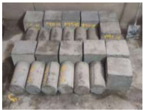
Fig.10 Air Curing