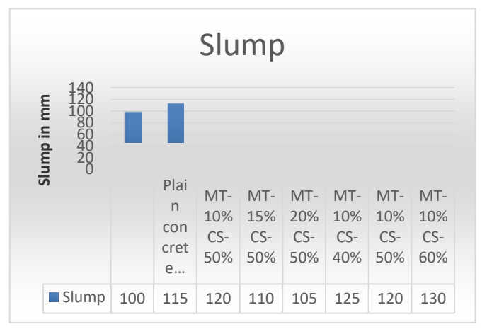
Fig. 13 Slump Chart