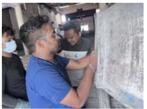
Fig.8 Concrete being mixed in a concrete mixer.

Cement, metakaolin, copper slag, aggregates (coarse and fine), and water are merged to generate the concrete mix. To guarantee adequate workability and uniform dispersion of the parts, carefully mix every component as illustrated in Fig.8.