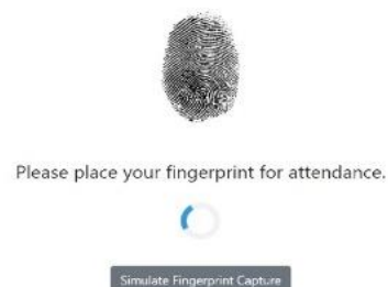
Fig -4: Sample Fingerprint