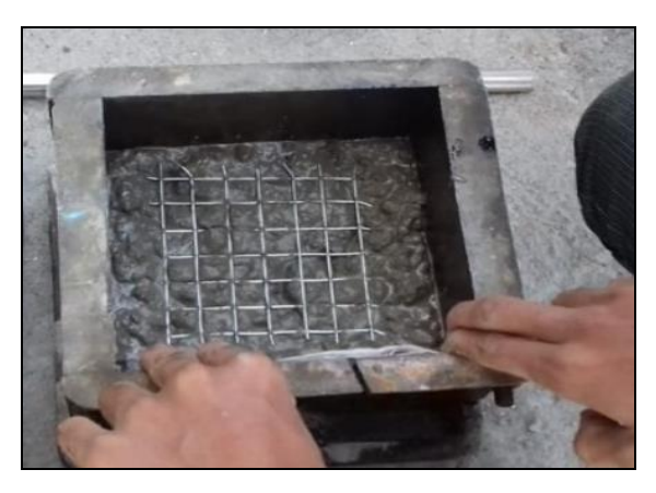
Fig -1: Wire mesh arrangement 1

With PCC, there is no need to lay steel mesh. However, our project requires steel mesh to make reinforced concrete. To investigate the difference in strength between ferrocrete and his PCC, steel nets with different arrangements are inserted into the mold during filling. To insert the steel net, the mold must be half filled and properly compacted. Then hold the steel net horizontally, leaving 20 mm of cover on all sides. In the case of a vertical net, push the net vertically into a halffilled mold, and in the case of a diagonal arrangement, push the net diagonally so that the mesh is free, covering about 20 mm from all sides, filling the mold and compressing it. To do. I'm shaking. For beams, pour a single layer of 20mm concrete and compact it. Next, insert the U-shaped net and completely fill the mold, leaving 20 mm of cover from the top. Next, a layer of mesh is inserted and the mold is completely filled and compacted.