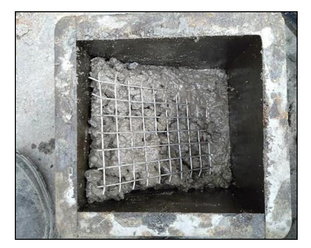
Fig -3: Wire mesh arrangement 3

International Research Journal of Engineering and Technology (IRJET)e-ISSN: 2395-0056Volume: 10 Issue: 12 | Dec 2023www.irjet.netp-ISSN: 2395-0072