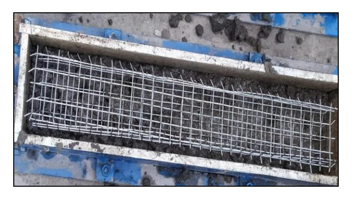
Fig -4: Wire mesh arrangement 4

Tests were performed on 36 cubes and 18 beams with different steel grid arrangements and curing times of 7, 14, and 28 days.