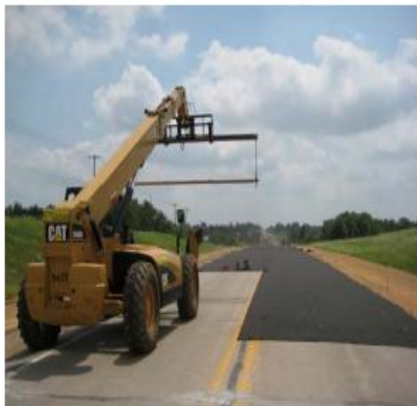
Figure 7 – Geotextile Fabric Placement