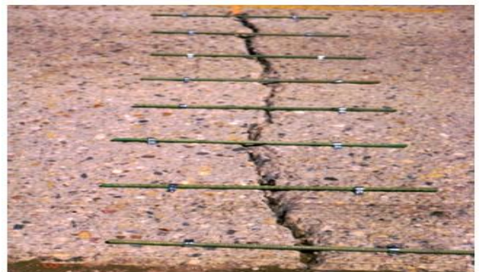
Figure 16 Reinforcement over transverse cracks in the existing concrete pavement prior to overlay placement 1994