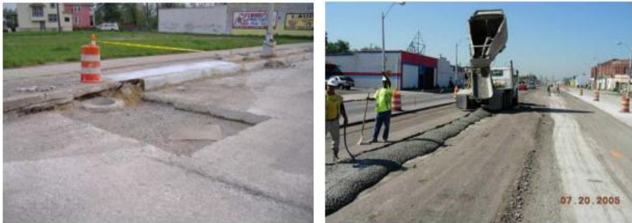
Figure 10 – Pre-Overlay Repairs