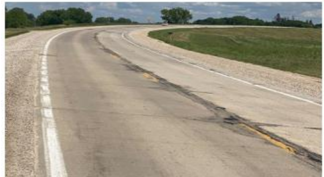
Figure 18 West end of the COC-B overlay on Iowa 3 in August 2021