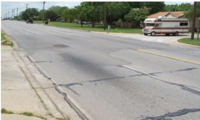
Figure 19 Existing 3 in. thick asphalt overlay on 15th Street prior to milling

Del City, Oklahoma built a 3 in. thick bonded asphalt overlay over an existing 7 in. thick concrete pavement that was built in the 1970s in the fall of 1994. The project was located on a 1.25 mi long section of commuter route 15th Street. The 3 in. thick asphalt overlay was cold-milled and replaced with a 3 in. thick COC-B overlay by the city in 2003. At that time, 15th Street saw about 7,500 daily vehicles, with 5% of them being trucks. Figure 19 depicts the existing asphalt surface before milling, and Figure 20 depicts the existing concrete pavement following the milling of the asphalt surface. Asphalt was also milled in the curb and gutter portions to match the slope of the existing gutters Figure 20 Any residual asphalt was manually removed after the cold-milling of the asphalt, and non-stable panels were removed by doing full-depth concrete patch repairs at certain spots. Shot blasting was used to considerably roughen the surface of the milled concrete in order to remove any microcracking that may have resulted from the milling process and to improve bonding. As illustrated in Figure 21, many No. 5 reinforcing bars with U-shaped bends were secured over nonworking longitudinal fissures in the pre-existing concrete. After 15 years, the fracture areas were examined, and tight cracks in the overlay were noted. Figure 22 depicts the COC-B overlay's state in 2020.