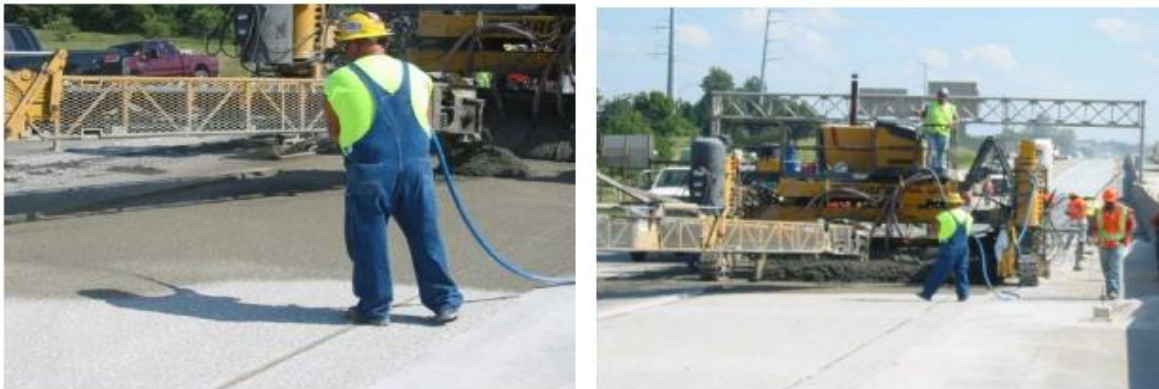
Figure 5 – Slurry Application and Concrete Placement