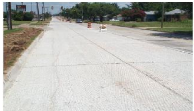
Figure 20 Existing concrete on 15th Street after milling the 3 in. thick asphalt overlay