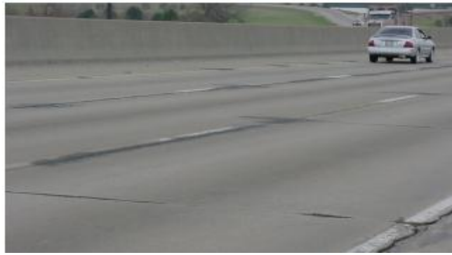
Figure 4 – Condition of Existing Concrete Pavement