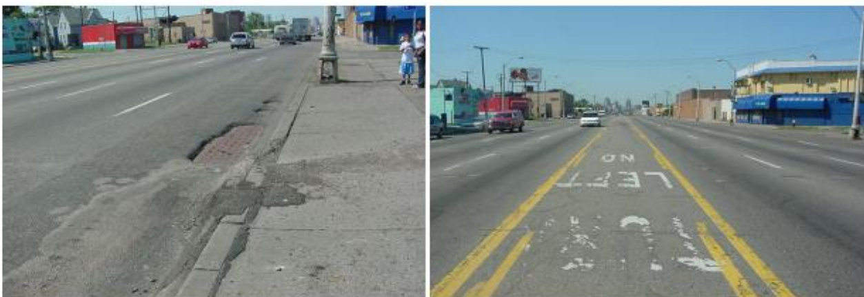
Figure 9 – Condition of Existing Composite Pavement