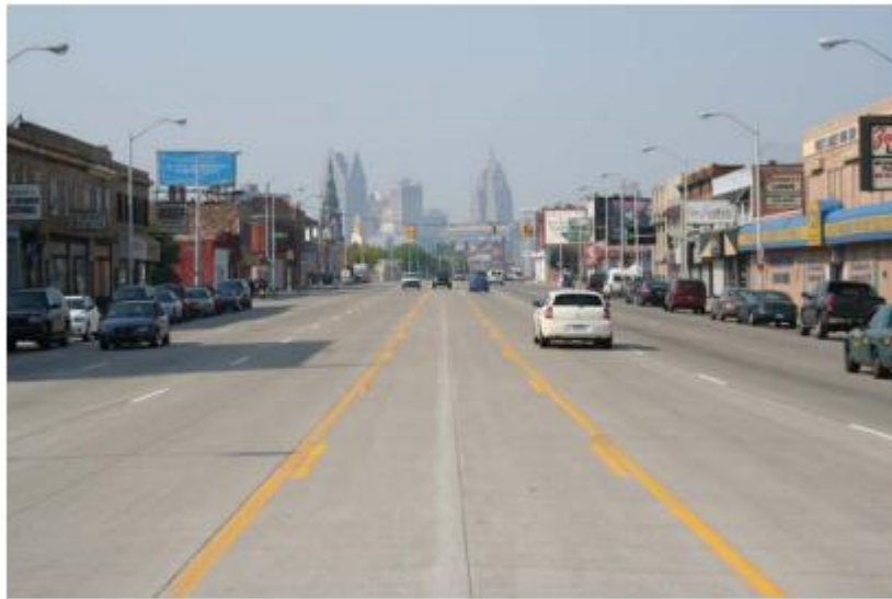
Figure 12 – Completed Thin Unbonded Overlay