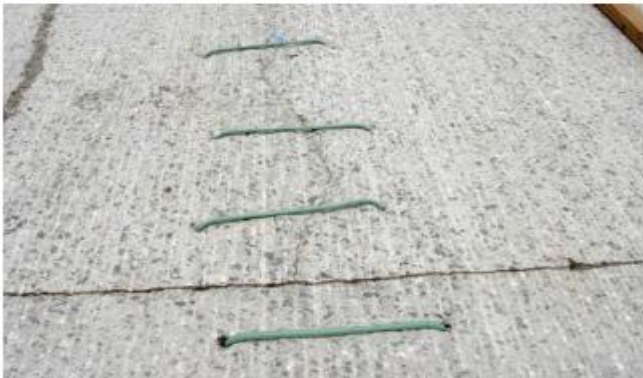
Figure 21 U-shaped No. 5 tied bars fastened over longitudinal cracks in the existing concrete