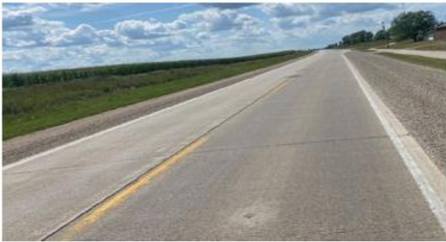
Figure 17 East end of the COC-B overlay on Iowa 3 in August 2021, showing pavement in fair to good condition