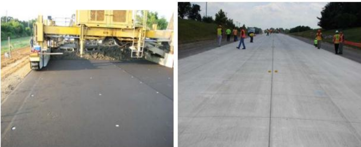
Figure 8 – Slipform Paver over the Fabric and Completed Unbonded Overlay

The MoDOT is pleased with the initial project results and will continue to assess the overlay's effectiveness in the coming years. After around 16 months of use, the thin unbonded overlay is still functioning effectively.