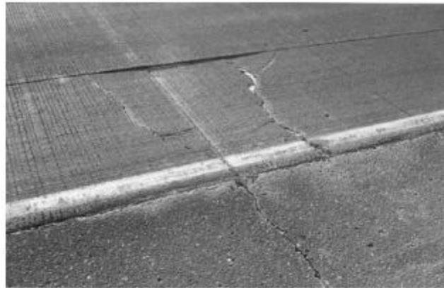
Figure 3 – Thin Bonded Concrete Overlay Panel Cracking and Settlement