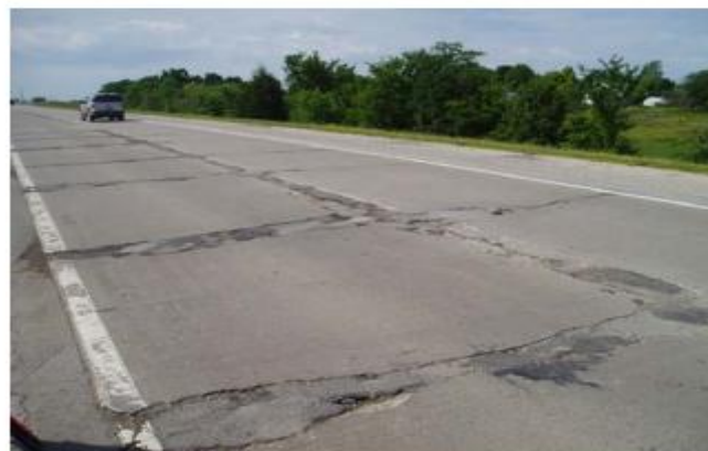
Figure 6 – Condition of Existing Concrete Pavement

In Missouri in 2008, a geotextile cloth was used as an interlayer in a thin, revolutionary unbonded concrete overlay. The 3.13-mile (5-kilometer) long project is situated between Routes 150 and 58 along a stretch of Route D in Jackson County. The current jointed concrete pavement, which is 30 feet (9.1 metres) apart and 8 inches (200 mm) thick, was built in 1986. At transverse joints, one-inch (25 mm) dowel bars were employed. The Missouri DOT (MoDOT) anticipated that up to 25% of the pavement area would need full-depth repair prior to a typical AC overlay as of 2008 since the pavement section was showing severe D-cracking along both transverse and longitudinal joints. Figure 6 depicts the state of the pavement as it stands right now.