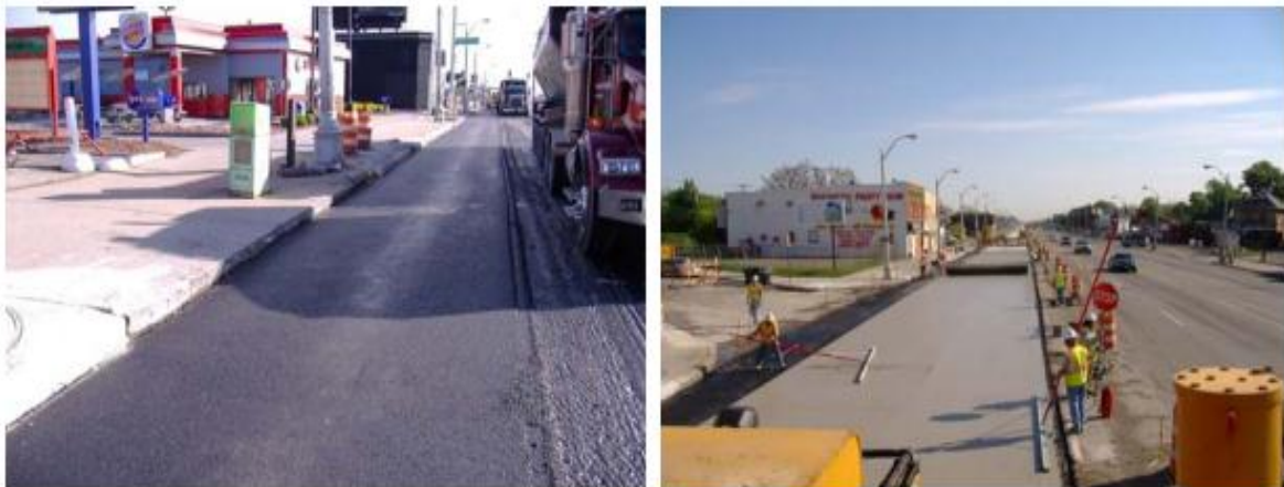
Figure 11 – AC Interlayer and Concrete Placement