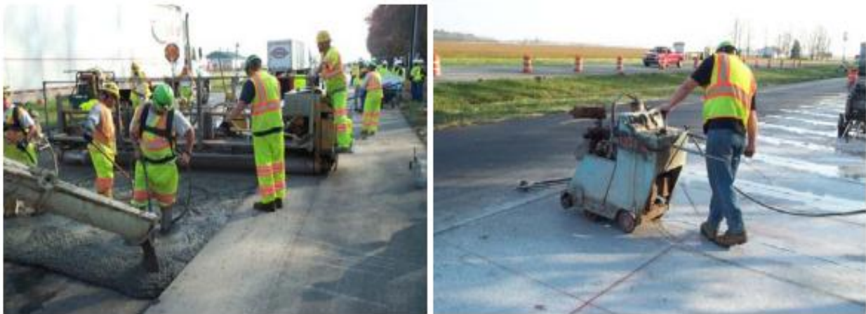
Figure 14 – Bonded Concrete Inlay Placement and Inlay Joint Sawing