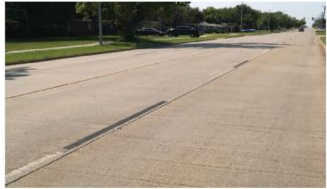
Figure 22 Condition of 15th Street in September 2020