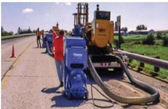
Figure 15 Existing concrete pavement in 1994 prior to overlay placement, with a shotblasted in operation and some spot spalling evident at the centreline joint