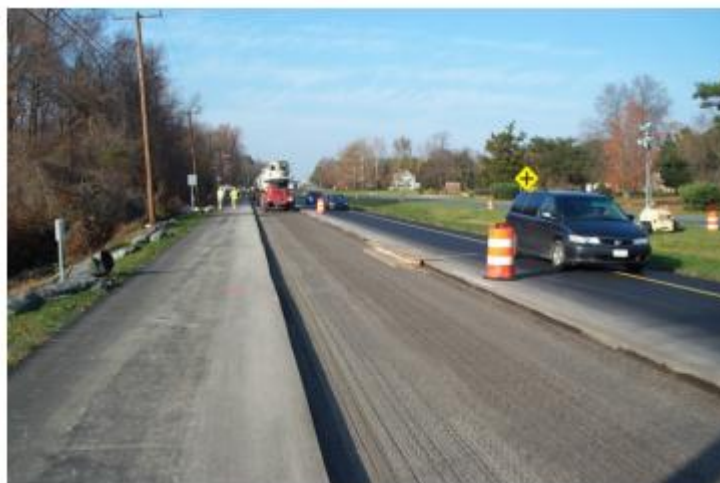
Figure 13 – Milled AC Pavement (Outside Lane)

In Felton, Delaware, a portion of US 13 was built using a thin, bonded inlay of an existing AC pavement in November 2009. The job entailed putting a 6 in. (150 mm) thick bonded inlay after machining a 6 in. (150 mm) section of the outer lane. A small number of pre-overlay tasks were completed to patch up holes and fill fractures in the existing AC pavement. The overlay concrete had to reach compressive strength of 2,000 psi (13.8 MPa) in 12 hours to allow opening to traffic the following day. The panel measurements for the inlay were 6 by 6 foot (1.8 by 1.8 m). Figure 13 depicts the milled AC pavement prior to the application of an overlay. the location of the concrete inlay and the inlay joint sawing are shown in Figure 14.