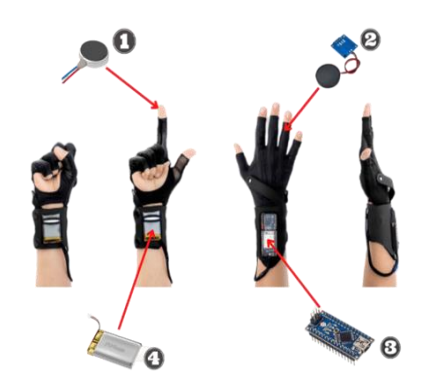
Fig:2 -Components of Proposed System

The model is designed to assist people with multiple disabilities to communicate effectively. It consists of four main components: the tap sensor, vibration coin, ESP8266, and lithium-ion battery.