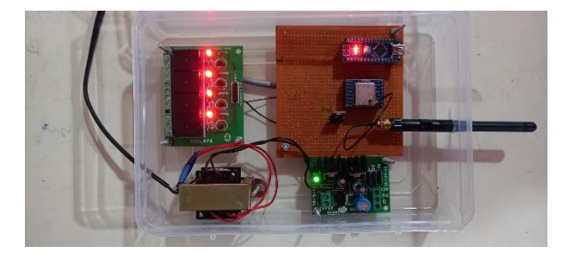
Fig-8: Relay control to load

In addition, the LORA-based smart gloves system was customized for different individuals based on their unique needs. The flex sensors were strategically placed at different locations on the glove, and the Arduino board and receiver were programmed accordingly to accommodate these variations. The system was observed to be easy to use and user-friendly for individuals with mobility impairments.