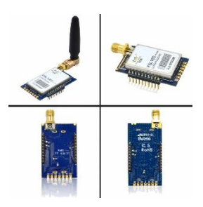
Fig-5: LoRa Transmitter and Receiver module

Integrating a LoRa Transmitter and Receiver module into an intelligent glove designed for visually impaired individuals using flex sensors can offer several benefits. One of these benefits is the ability to control other devices or systems, such as robotic arms or drones, through hand gestures. The flex sensors can detect the degree of bending or flexing of the hand and fingers, which can be translated into specific commands or actions that control the device. The LoRa module can then transmit these commands wirelessly, allowing the user to control the device from a distance.