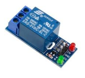
Fig -6: Relay

Moreover, the use of a relay can also enhance safety by isolating the low-power control circuit from the highpower circuit that is being switched. This can help prevent electrical shocks or damage to the control circuit in case of a fault or overload in the high-power circuit.