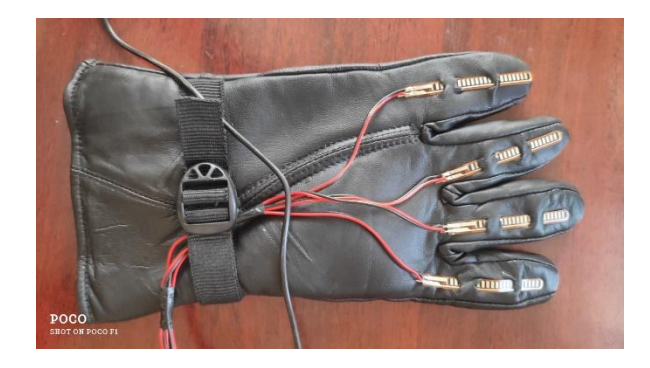
Fig-7: Smart gloves

The LORA-based smart gloves designed for disabled individuals, which utilized Arduino, flex sensors, and LoRa wireless communication, have produced promising results. The system has been shown to effectively control electrical loads by utilizing hand movements. The flex sensors detect the hand movements, which are then transmitted via LoRa wireless communication to a receiver responsible for controlling the electrical loads. The system was put to the test with various electrical loads such as lights and fans and was successful in controlling them with ease.