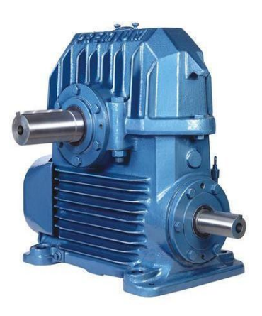
Fig -4.5: Reduction Gearbox

The motor's input speed is decreased while its output torque is increased by using a reduction gearbox, also referred to as a speed reducer. The gadget is used to convert the basic engine's output shaft revolutions into the propeller-moving revolutions. The wheels and pinions in the reduction gearbox have teeth that mesh, transferring power from a drive shaft to a driven shaft and lowering speed.