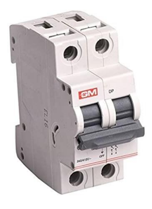
Fig -4.7: MCB

This is utilized in commercial or industrial applicationswhen there is a potential for increased short circuit current levels in the circuit. 5 to 10 times the full load current triggers a trip on this sort of MCB. The associated loads generally have an inductive character (e.g. induction motors) Protection against overloads and short circuits, control of circuits, and protection forresistive and inductive loads with low inrush current are all functions of type C MCBs.