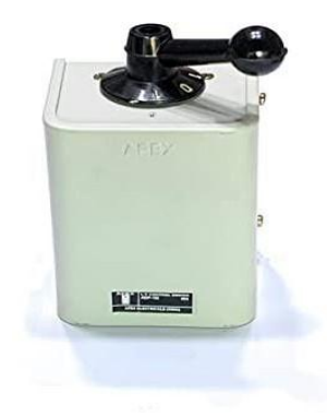
Fig -4.4: Changeover switch

The power circuit for the motor control receives a 440V single-phase supply. Finally, the Forward Start button is depressed. The Forward contactor in the power circuit is actuated when the Control Supply is applied to the NC contacts of Limit Switch 1 and Reverse Contactor, causing the motor to rotate forward (clockwise). As soon as Limit Switch 1 received the signal, it changed from NC to NO, deactivating the Forward Contactor coil. The Reverse Start button must be pressed to activate the Reverse Contactor for reverse control. Here, the control circuit energizes the reverse contactor coil, activating the reverse contactorin the power circuit. The power for the motor was provided by the reverse contactor.