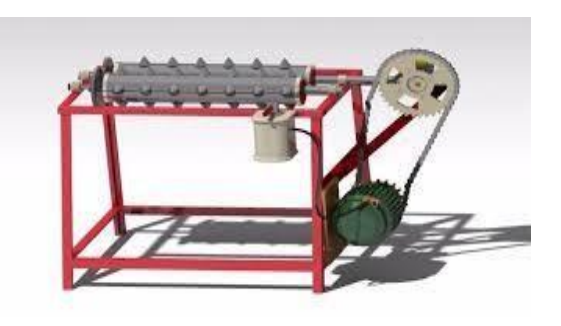
Fig -3.1: Design of the Coconut Dehusking Machine

The coconut Dehusking machine works on single phase1 HP Induction motor. The motor works on single phase 230 v AC 50 Hz supply. The dehusking machine is electrically operated. The single phase 1 HP motor is fitted on metal frame with gear. The motor output is given to bladed rotor and gerbox. The gearbox connected to types or turbine, which moves reverse direction with respect to blades rotor.