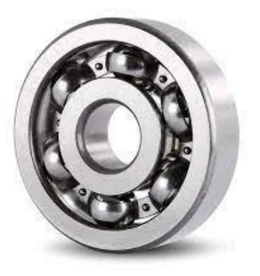
Fig -4.3: Ball Bearing

A specific type of rolling element bearing called a ball bearing uses balls to maintain the distance between the bearing races. The primary purposes of a ball bearing are to support radial and axial loads as well as to reduce rotational friction. At least two races are employed to contain the balls and convey the stresses through the balls. The majority of applications link one race to the rotating assembly while leaving the other stationary (e.g., a hub or shaft). The rotation of one of the bearing races causes the balls to spin as well. Because the balls are rolling, the coefficient of friction is much lower than it would be if two flat surfaces were moving in opposition to one another.