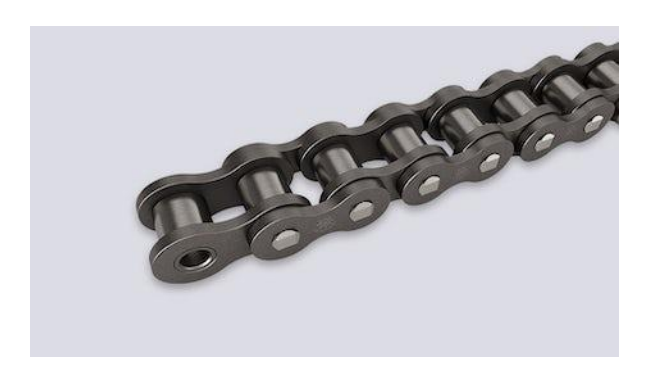
Fig -4.6: Chain Drive

Using a chain drive, mechanical power can be moved from one location to another. It is frequently utilized to power a vehicle's wheels, particularly the ones on motorbikes and bicycles. It is used in a vast array of other machinery in addition to automobiles. In order to transmit power, a drive chain or transmission chain—which is most usually used passes over a sprocket gear, and the teeth of the gear mesh with the holes in the chain links. The gear is turned, and this pulls the chain putting mechanical imposing force on the system.