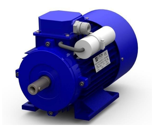
Fig -4.2 : Single Phase Induction Motor

The roller shaft, which is fixed to the end of the frame structure, is found to be driven by it. A sizable pulley that the belt goes around is found at the motor's free end of the shaft. Single-phase induction motors can operate with just one power phase. They are frequently employed in lowpower rating applications for both household and commercial use. An induction motor is an AC electric motor in which the magnetic field of the stator winding is used to electromagnetically induce the electric current into the rotor necessary to produce torque. Hence, it is possible to construct an induction motor without electrical connections to the rotor. Either a wound-type rotor or a squirrel-cage-type rotor can be used in an induction motor.