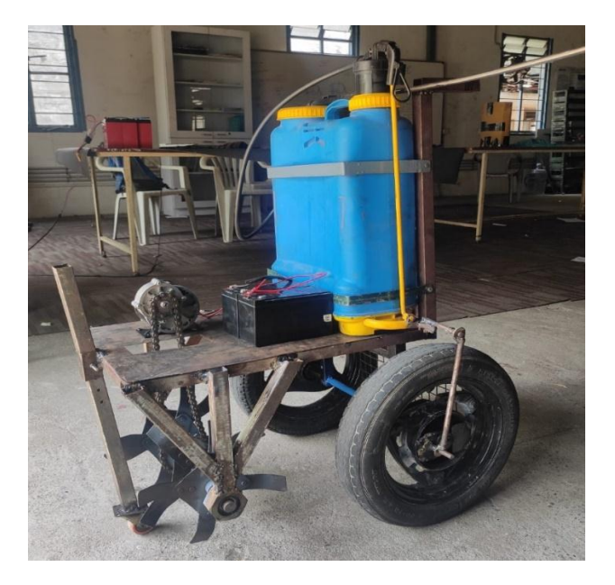
Fig 12: Prototype