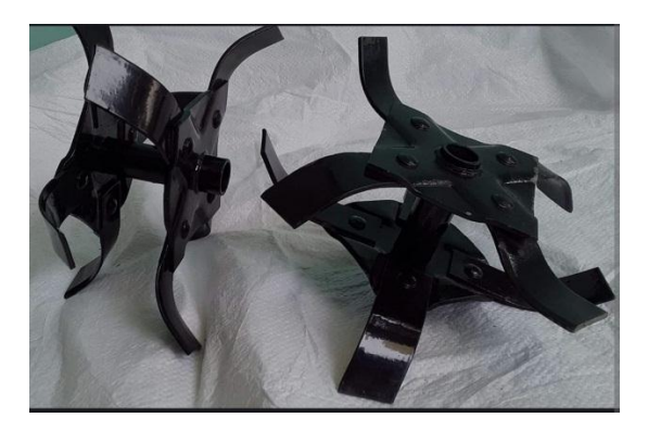
Fig 5: Weeder blade

The crucial component of a stainless steel rotavator that propels the device in seed bed preparation and residual soil mixing is the blade. Rotavator blades can also be used as weed eaters by cutting through weed plants. (L x W x H) – (10 x 10 x 10) centimeters.