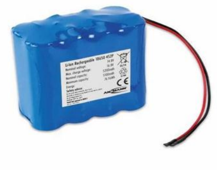
Fig 10: Battery

A lithium-ion (Li-ion) battery is an advanced battery technology that uses lithium ions as a key component of its electrochemistry. During a discharge cycle, lithium atoms in the anode are ionized and separated from their electrons. The lithium ions move from the anode and pass through the electrolyte until they reach the cathode, where they recombine with their electrons and electrically neutralize. The lithium ions are small enough to be able to move through a micro-permeable separator between the anode and cathode. In part because of lithium's small size (third only to hydrogen and helium), Li- ion batteries are capable of having a very high voltage and charge storage per unit mass and unit volume.