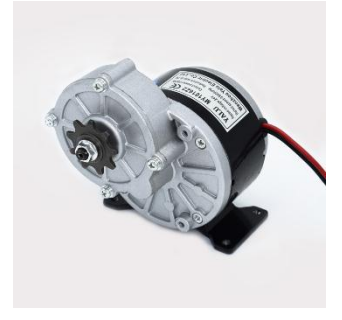
Fig 4: Motor

This is MY1016 25OW eBike Motor with Electric Bicycle Combo Kit which has all assembly product you need to build your eBike. It is an Electric Bicycle permanent Magnet DC Motor. MY1016 24-volt 250-watt output for electric scooter and bike motor. This MY1016 is popular reduction motor, simply the most commonly used motor for Scooters, Bikes and quad's available in the market! It is normally found in the better-quality quads and scooters on the market and is classed as a mid-range combination. Now here it comes combo with all necessary items to build your brand new eBike and to save your efforts in looking out for all compatible products and you can get it in just one go at reasonable cost.