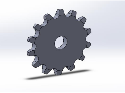
Fig 2: chain sprocket

A sprocket, sprocket-wheel or chain wheel is a profiled wheel with teeth, or cogs that mesh with a chain, track or other perforated or indented material. Sprockets are used in bicycles, motorcycles, tracked vehicles, and other machinery either to transmit rotary motion between two shafts where gears are unsuitable or to impart linear motion