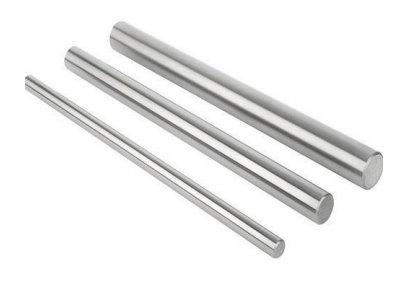
Fig 6: shaft

A shaft is a rotating machine element which is used to transmit power from one place to another. The power is delivered to the shaft by some tangential force i.e. twisting moment. In order to transfer the power from one shaft to another, the various members such as pulleys, gears etc. are mounted on it by means of keys or splines. We may say that a shaft is used for the transmission of torque and bending moment.