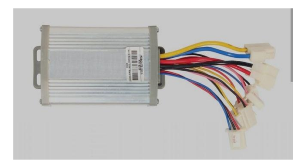
Fig 8: Speed controller

A circuit that electronically monitors and controls an electric motor's speed is known as an electronic speed control (ESC). Furthermore, it might offer dynamic braking and motor reversal. In radio-controlled models with electrical power, tiny electronic speed controls are employed. Systems for managing the drive motors' speed are also included in full-size electric cars.