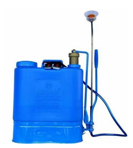
Fig 7: Sprayer