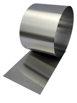
Fig 9: Sheet metal

Sheet metals are used historically for plate armor worn by cavalry and widely used for decorative purposes. The applications of sheet metals include automobile and truck (lorry) bodies, medical tables, airplane fuselages and wings, roofs for buildings (architecture), and many other applications. Sheet metal made of iron and other materials with high magnetic permeability has good applications on electric machines and transformers. Thickness of sheet metals are specified in millimeters all around the world. But in US it is commonly specified by a traditional, non-linear measure known as gauge, the larger the gauge number the thinner the metal. The most common used steel sheet metal ranges from 30 to about 7 gauges.