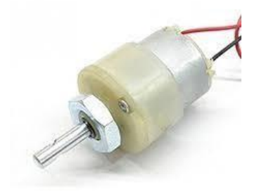
Fig-7 DC Motor

This type of security mechanism can be used in a variety of applications, such as access control to buildings or vehicles, or to secure sensitive equipment. By using biometric authentication, such as a fingerprint, the system can ensure that only authorized individuals can access the system or equipment.