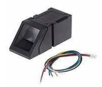
Fig -3: Fingerprint sensor

The way in which a fingerprint scanner operates is through the use of either optical rays or a capacitive array circuit. Optical sensors emit a bright light onto the finger, which then captures a digital image of the fingerprint. The pattern of the fingerprint is then translated into a series of 0's and 1's to create a unique identification key or source code. If the key matches that of an authorized user, access will be granted to the system.