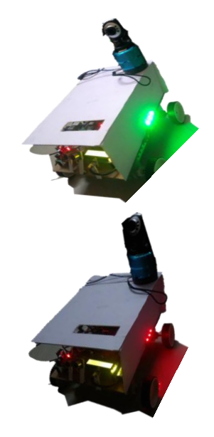
Fig -5: Green LED is lit when there is a safe environment otherwise Red LED is lit.