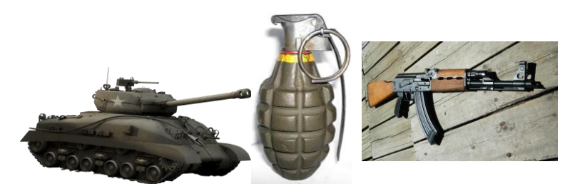
Fig -3: Tanker, grenade, and gun are captured

• Sends them to the open-cv, which detects them.