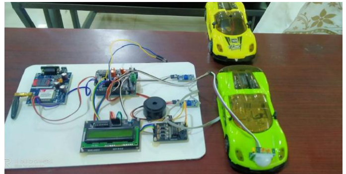
Fig 2: Complete Working Model of reducing the noise pollution caused by honking of vehicles