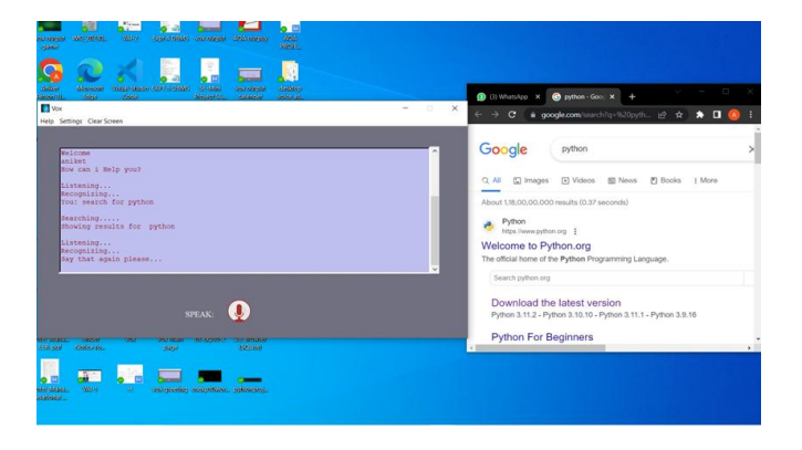
Figure 4.2. Command Execution

In the above figure, the user says 'Wikipedia movie' which implies to describe the word movie through Wikipedia.