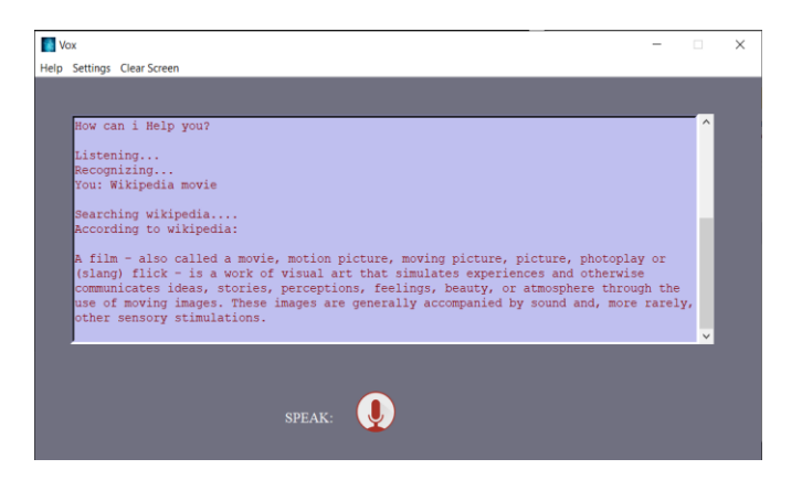
Figure 4.1. Command Execution

After taking the user desired input, it executes the command.