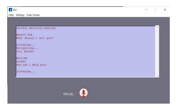
Figure 3. Welcome Page