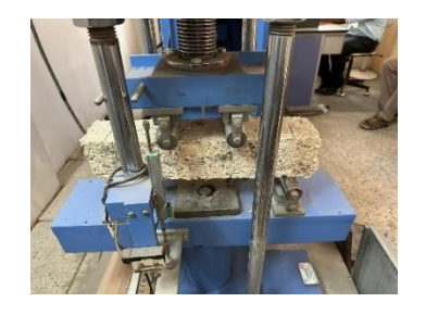
Fig. 2: Flexural Strength test Specimens