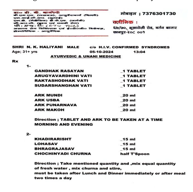
Fig-4; Integrated treatment prescription of a HIV patient; Selected Ayurveda and Unani Remedies, Px_Page-1

Below is given an Integrated remedial specimen example prescription of an infected H.I.V. Patient, which is consisting of AYUSH medicines with Allopathy remedies.