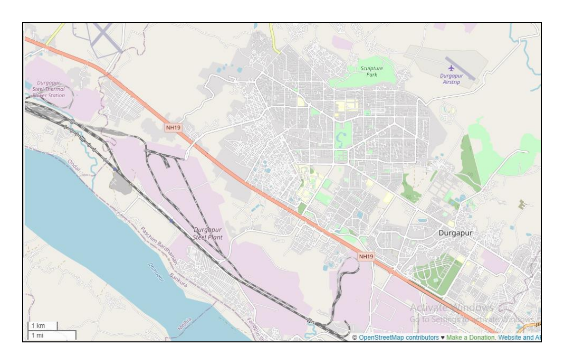
Fig-1: Map showing the Durgapur integrated industrial township (OpenStreetMap, 2023)