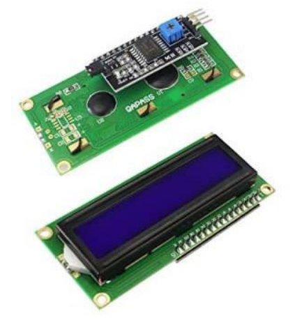
Fig: LCD display with 12C interface

With a 16x2 LCD, we have the capability to showcase 16 characters per line on two lines, providing ample space for displaying our data.