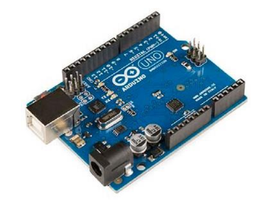
Fig: Arduino Uno

The Arduino Uno lies the Atmega328P microcontroller, which provides processing power and I/O capabilities for controlling electronic components. The Uno board features a set of digital input/output (I/O) pins (14 in total), which can be configured as either inputs or outputs, allowing it to interface with various digital sensors, LEDs, motors, and other peripherals. Additionally, it includes six analog input pins, enabling the reading of analog sensors. The Uno can be easily connected to a computer via USB, allowing for programming and communication with the board. Arduino provides a user-friendly IDE that simplifies the process of writing, compiling, and uploading code to the Uno board. Arduino Uno is compatible with a wide range of expansion boards called "shields," which add additional functionalities such as wireless communication (Wi-Fi, Bluetooth) and many more.