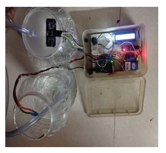
Fig: Proposed system

The pump is automatically turned off after it reaches the predetermined upper water level.. This happens when the distance of the water surface from the ultrasonic sensor is less than h90%. The ultrasonic sensor's Echo and Trigger pins are connected to pins 8 and 9 of the Arduino board respectively. Now, connect pin 13 of the Arduino to the input pin of the relay board. Attach the pump to the relay board's AC circuit. Consider relay as switch. The LCD module, equipped with an I2C interface can be connected by using only two analog pins, which in this case are connected to the A0 and A1 pins of the Arduino board. Now, provide the +Vcc and GND connections to the ultrasonic sensor, relay board, and LCD module using +5V and GND from Arduino. We also have the push button and a SPST switch at pin 10 and 14 respectively which help us to switch between the auto/manual modes for the pump operation.