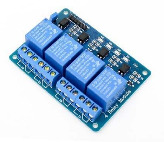
Fig: Relay board

Relays are electromechanical switches that open or close circuits based on the application of a control signal. They consist of an electromagnetic coil that, when energized, generates a magnetic field, causing movable contacts to change position. These contacts physically connect or disconnect the circuit. In this instance, we controlled a 240V pump using a four-channel 5V relay board. Maximum current for the relay is 10A at 250 volts AC or 10A at 30 volts DC. This board has three high-power connections: Common (COM), Normally Open (NO), and Normally Closed (NC) with 5V VCC, GND, and control pins.