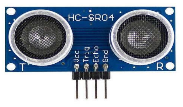
Fig: Ultrasonic sensor

Arduino microcontroller is used to process the ultrasonic distance sensor's output, which is sent to the signal conditioning section for calculation of the target's distance. After being fed to the LCD display, the microcontroller's output is transferred to a personal computer.