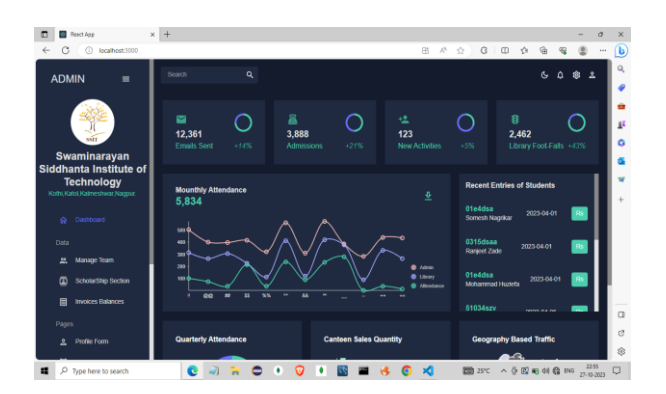
Screenshot 1: Dashboard