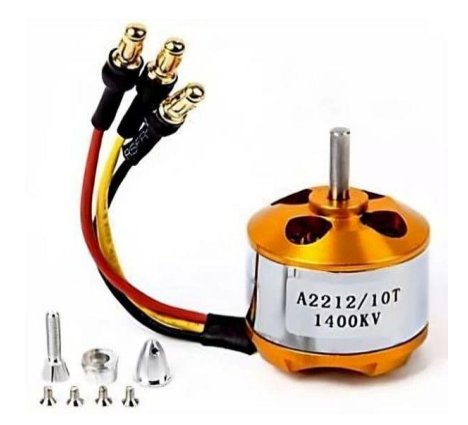
Fig no 7.BLDC Motor

A Brushless DC (BLDC) motor is a type of electric motor that uses electronic commutation instead of brushes for switching the magnetic field. Known for efficiency and durability, BLDC motors find applications in drones, electric vehicles, and appliances. They offer precise control, longer lifespan, and reduced maintenance compared to traditional brushed motors