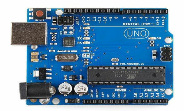
Fig.2 Arduino uno

A micro controller board based on atmega2560. It has 16 Analog pins and 14digital I/O pins. Can be used as PWM output, (hardware serial ports), 16 MHz crystal oscillator, a USB connection, a power jack, reset button.