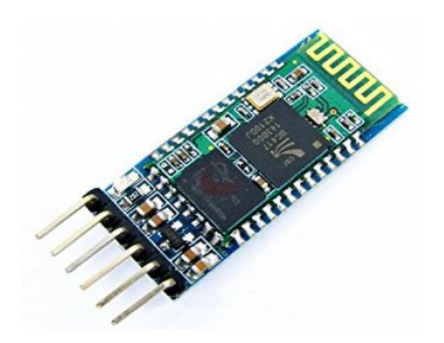
Fig no 6. Bluetooth module

Volume: 11 Issue: 03 | Mar 2024 www.irjet.net p-ISSN: 2395-0072