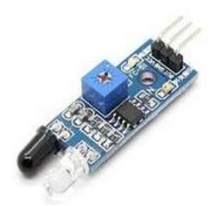
Fig.3 IR Sensor

An Infrared (IR) sensor detects infrared radiation in the form of heat, converting it into an electrical signal. Commonly used in electronic devices, security systems, and appliances, IR sensors enable functions like proximity sensing and remote control operation. They operate by detecting variations in IR radiation, making them versatile in various applications.