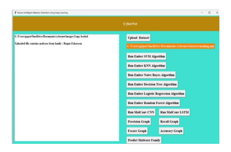
Fig: 3 File Dialogue Window

The two pictures display the user interface of 'CyberNet' a cybersecurity software. In the image labeled as Fig; 3 there are predictions of types of attacks shown on the CyberNet interface probably related to uploading datasets. The second image, in Fig; 3 exhibits a file dialog box and a confirmation message on CyberNet confirming a file upload. Each illustration represents a step in the process of inputting data into the system for analysis offering options to execute algorithms and visualize outcomes. This layout simplifies user engagement, for data handling and security assessment.