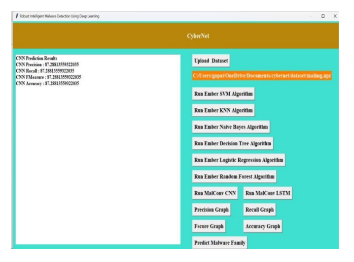
Fig: 3 Type of Attack Prediction