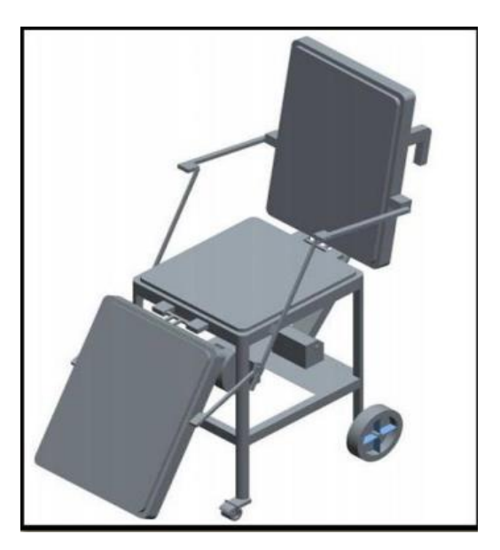
Fig -1: Simple Structural diagram multipurpose wheelchair.