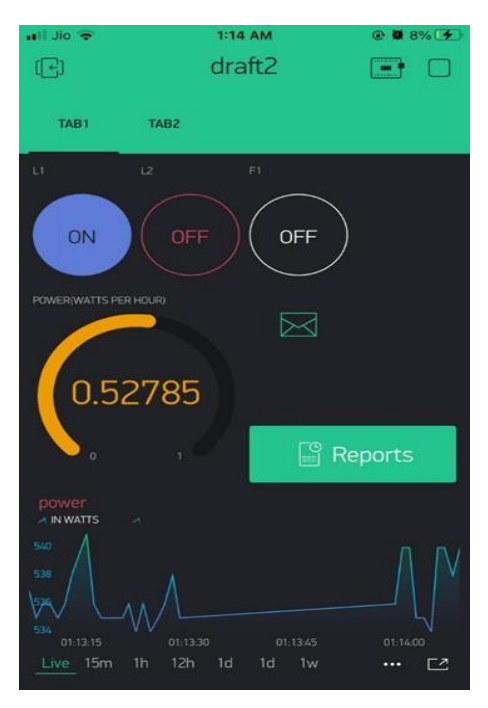
Fig -5.3 : Screenshot of the Thingers.io application showing the graph of the power consumed and the On & Off Buttons to Control the connected load.