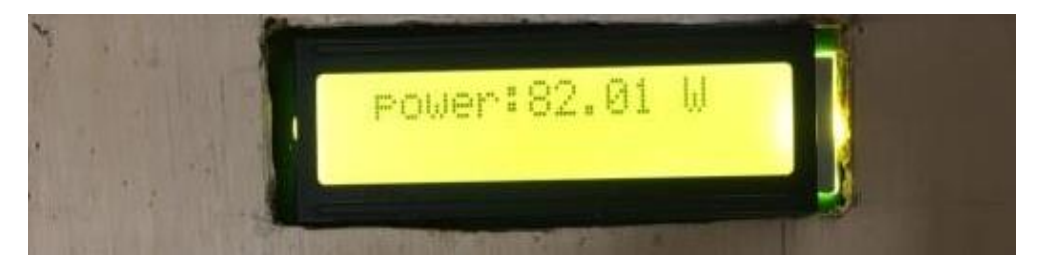
Fig -5.2: Power Reading on the Lcd Display.