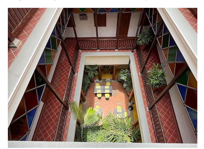
Fig -4 : Teakwood and courtyard from Tamil architecture and stained glass from French colonial influence in Maison Perumal, source: tripadvisor.

Maison Perumal in Pondicherry showcased a harmonious blend of French colonial and Tamil architectural elements, with teakwood columns and stained glass features complementing the traditional furniture styles.