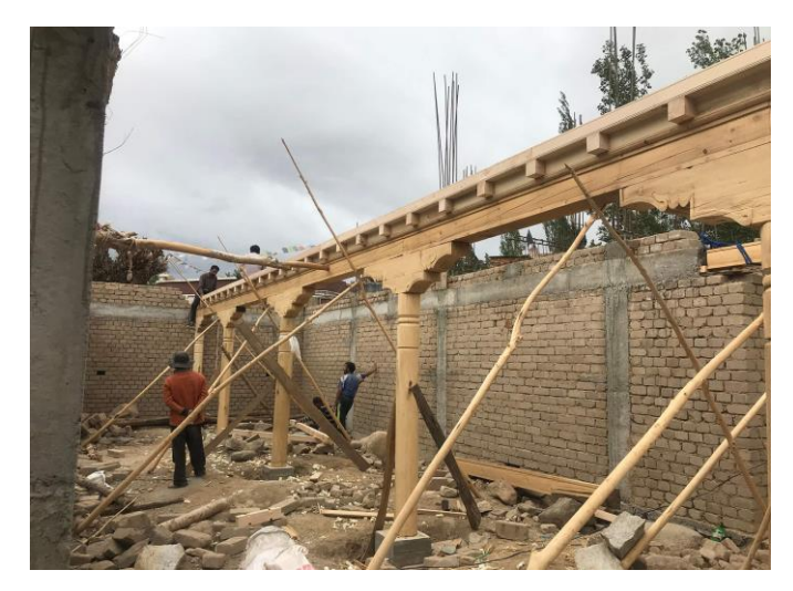
Fig -1 : Arch details of Dolkhar done by local craftsmen

A common practice observed across the case studies was the use of a single cultural parameter as a focal element, serving as the primary means of cultural representation. For instance, in the Dolkhar hotel, locally sourced materials and traditional crafts took center stage, with the building and interior elements crafted by local artisans using indigenous techniques. Similarly, the Tree of Life Resort in Jaipur prominently featured traditional motifs and symbolism, with inlaid floral patterns and elements like peacock motifs adorning various surfaces.