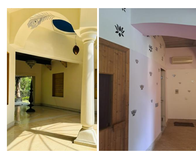
Fig -2 : Symbolism detailing at Tree of Life Resort

Likewise, Hotel Riomar uses a color as a primary theme which is rooted to Spanish culture. All the spaces has this color integrated one way or another in the interior elements, tying the whole place together.