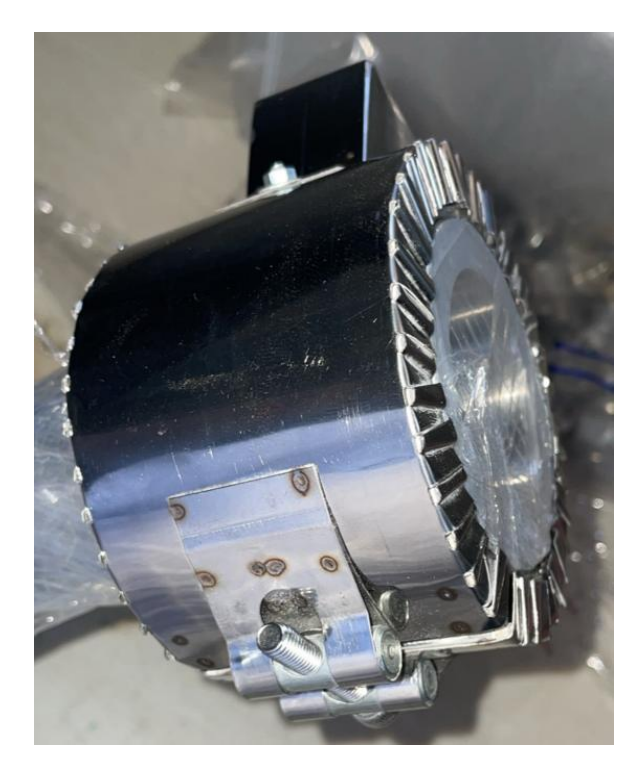
Fig -5: Heater

The heaters are positioned on the lateral surface of the copper tube to ensure the internal thermoplastic material reaches a fusion temperature of 350 degrees Celsius. This facilitates the extrusion process in the final step.