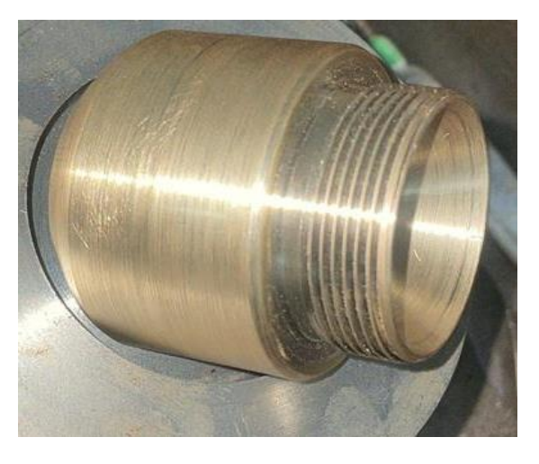
Fig -6: Nozzle

At the final section of the filament extruder, where the filament is discharged, there is a cylindrical component with an open top and a small hole in the center of its bottom surface. Typically constructed from brass due to its heat-resistant properties, this element is crucial for shaping the extruded filament. For the experimental setup, die will be employed with a diameter of 1.75mm for the small hole. Additionally, it features an inner hex shape to facilitate attachment to the end of the steel tube.