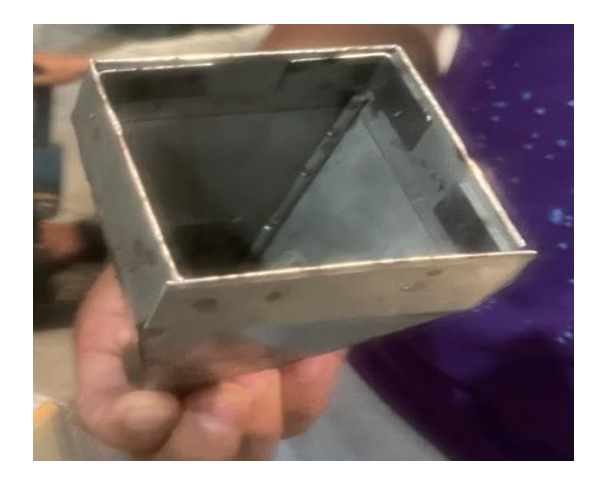
Fig -4: Hopper

The suction hopper serves a vital role in this process by retaining the required quantity of material for feeding into the screw.