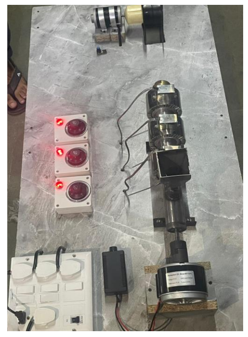
Fig -1: Extruder Design

The extruder is an extended, continuous process for working with polymers, employed in the production of tubing, tire treads, and wire coverings. This apparatus functions by pushing raw material in pellet form into a heated tube. The tube is heated by 2-5 heaters fixed on its external side. During this process, an endless turning screw, driven by a motor, facilitates the pushing of the raw material through the heated tube. The material is then compressed into a shaping die, ultimately resulting in the extraction of the final product – a filament with diameters of 1.75mm and 2.5mm (refer to Fig.1).