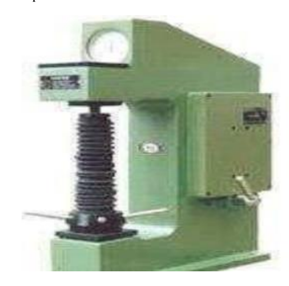
Figure 6.7 Brinell hardness testing machine

Where, P = Load (kg), D = Diameter of ball in mm. (2.5 mm) d = Diameter of indentation circle found from microscope