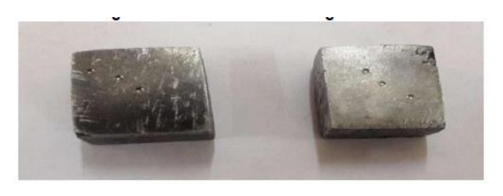
Figure 6.8 MMC sample after pockmark on Hardness Testing Machine