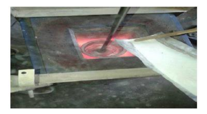
Figure 5.3 Preparation of sample by mechanical stir casting

IRJET Volume: 11 Issue: 04 | Apr 2024 www.irjet.net p-ISSN: 2395-0072