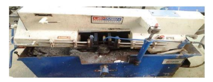
Figure 5.4 Cutting of samples on Power Hacksaw