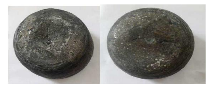
Figure 5.2 Sample of aluminium + Al2 O3 7.5 and 10% Alumina in Aluminium

© 2024, IRJET | Impact Factor value: 8.226 | ISO 9001:2008 Certified Journal | Page 577