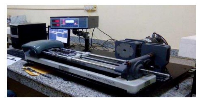
Figure 6.2. Tensile Testing on Tensometer

Tensile testing of MMC is conceded out on Tensometer machine. Tensometer is a device used to calculate the tensile properties of materials such as their Young's Modulus and tensile strength. It's a common testing machine loaded with a sample between two grips that are either adjusted manually or automatically to apply force to the model. The machine works either by driving a screw or by hydraulic ram. Testing is done by holding the specimen in the jaws of the Tensometer. The load is applied slowly and the material starts elongating. After the maximum load reached the specimen breaks.