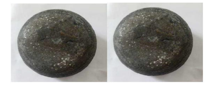
Figure 5.1 Sample of aluminium + Al2 O3 2.5 and 5% Alumina in Aluminium