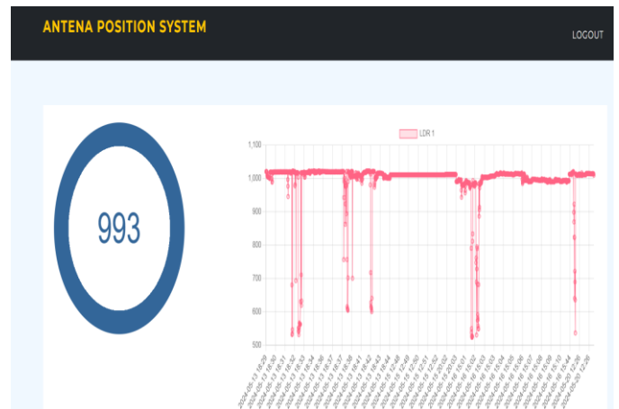
Fig 4.3 Visualize representation data exchange