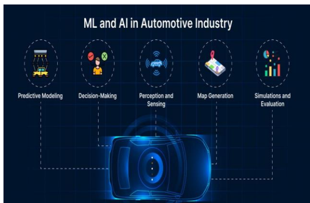
Figure-2: Advanced Vehicle with AI & ML

The integration of artificial intelligence (AI) with automotive systems presents a plethora of technical obstacles that must be surmounted to guarantee the reliability, safety, and efficacy of AI-driven functionalities. One notable challenge involves the necessity for robust and efficient hardware and software platforms capable of processing and analyzing copious amounts of data in real-time. AI algorithms demand potent computational resources to execute tasks such as object detection, decision-making, and sensor fusion, prompting the creation of specialized hardware accelerators and high-performance computing architectures customized for automotive applications. Furthermore, ensuring the interoperability and compatibility of AI algorithms with existing automotive systems and protocols presents a challenge, particularly as vehicles become increasingly interconnected and intricate.