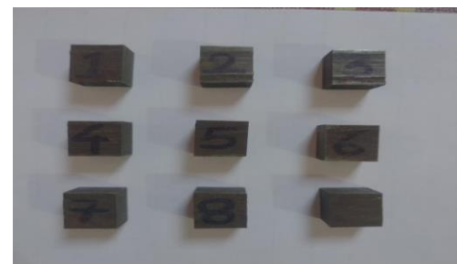
Fig. 2: Tested Specimens