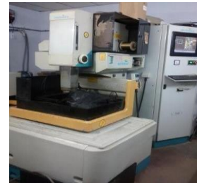
Fig -1: ELPULS-40 A

Machining operations were conducted on an ELECTRONICA SPRINTCUT Wire EDM machine. The setup provided consistent and controlled machining conditions. The dielectric system maintained a constant temperature and filtered debris to ensure accuracy and surface quality.