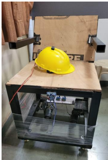
Fig. 3: Wheelchair Model

This system allows users to control a wheelchair using head movements in a hands-free, efficient, and safe way.