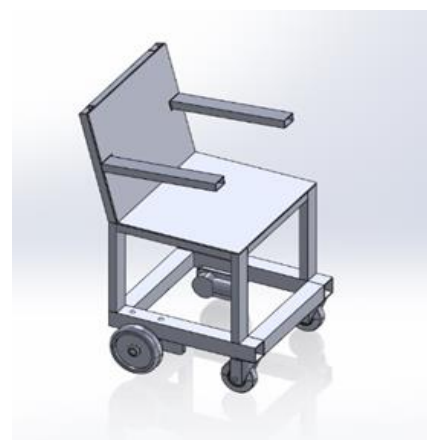
Fig. 2: Wheelchair CAD Model