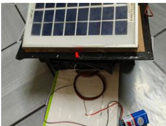
Fig-3: Indication of Wireless Coil

The proposed photovoltaic-assisted inductive charging model successfully integrates solar energy with wireless power transfer, achieving efficient, sustainable EV charging. Experimental results demonstrated a charging