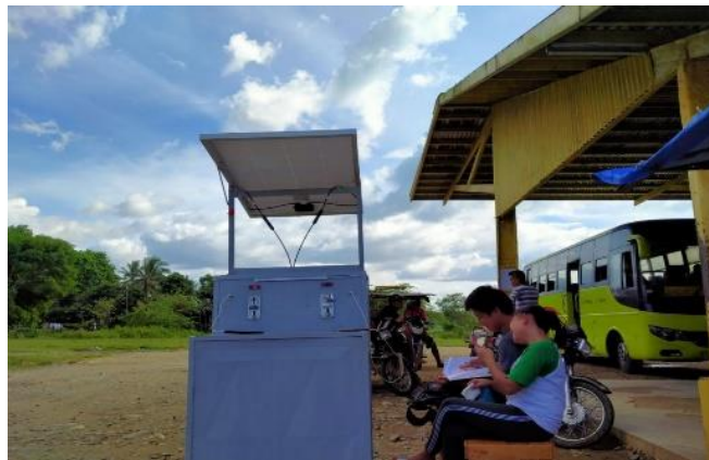
Figure 2. The machine in the public transport

The vending mechanism demonstrated precise performance, delivering charging durations exactly matching the time set by coin insertion. For smartphones, the device increased battery levels from an average of 28.74% to 45.31%, equivalent to a 57% gain. For basic phones, battery status rose from an average of 0.87 to 3.03 bars, representing a 248% increase. These results indicate that the system is both reliable and effective in providing timed charging services for different mobile phone types under real-world operating conditions.