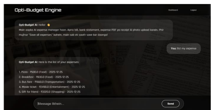
Fig -2: AI Expense Assistant Interface for Conversational Queries

Once an expense is added, updated or deleted, the system immediately recalculates totals, category-wise spending and monthly trends, ensuring real-time synchronization between stored data and dashboard analytics. This agentic AI-database integration reduces manual effort, improves accuracy and enables an intelligent, user-centric finance management experience.