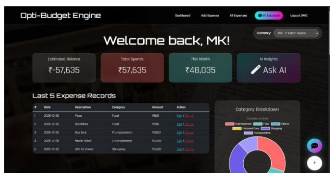
Fig -4: Real-Time Expense Dashboard with Category Breakdown

The dashboard module displays real-time analytics including total spending, balance estimation, category-wise expense distribution and monthly spending trends. CRUD functionality was verified through successful expense editing and deletion, ensuring data consistency. Additionally, the system supports PDF report generation, allowing users to export structured summaries of their financial activity. Overall, the functional testing confirms that Opti-Budget Engine delivers an intelligent, responsive and user-centric solution for modern expense monitoring.