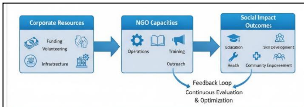
Fig-2: Corporate Social Responsibility–Non-Governmental Organization–Social Impact framework

The proposed Corporate Social Responsibility–Non-Governmental Organization–Social Impact framework is illustrated in Figure 2.