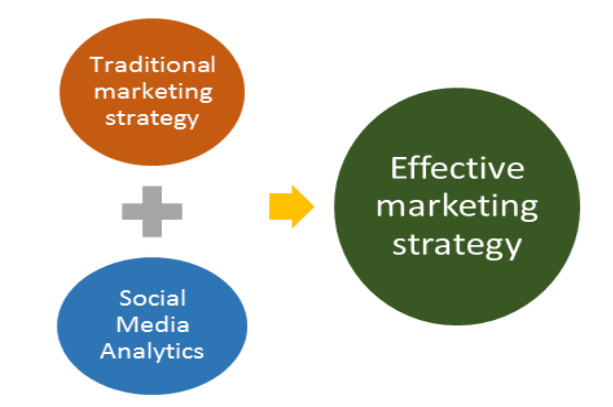
Fig-1: Effective marketing strategy

1.2 Importance of agility in marketing strategy While the entire industry is moving towards agility, time has really become a key parameter in deciding the success and failure of the marketing strategy. With social media, the response time is reduced from days and weeks to just minutes and hours. This gives an excellent opportunity to analyze the effectiveness of the strategy, customer sentiment and also capture the valuable feedback from the customers in little time. Based on the SMA, suitable changes can be made to the strategy or the plan which helps to market the product/service in a better way.