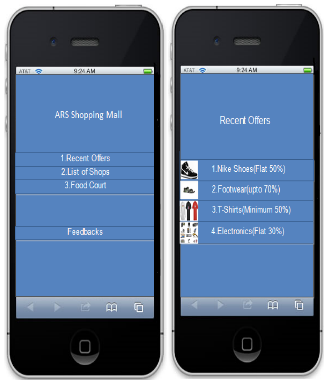
Fig-4: Shopping mall service