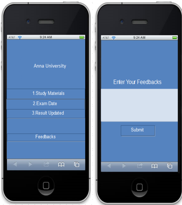
Fig-5: University Service