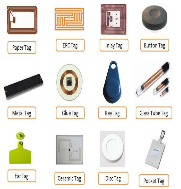
Figure 2: RFID tags

automatically identifying and tracking tags attached to objects. The tags contain electronically stored information. Some tags are powered by electromagnetic induction from magnetic fields produced near the reader. Some types collect energy from the interrogating radio waves and act as a passive transponder. Other types have a local power source such as a battery and may operate at hundreds of meters from the reader. Unlike a barcode, the tag does not necessarily need to be within line of sight of the reader, and may be embedded in the tracked object. Radio frequency identification (RFID) is one method for Automatic Identification and Data Capture (AIDC).