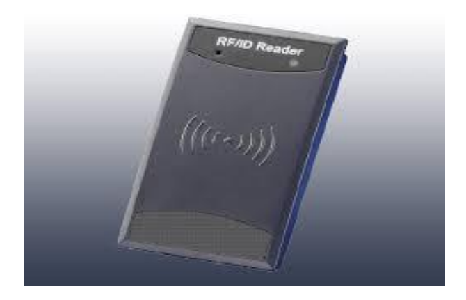
Figure: 3: RFID Reader

to boost the signal enough to awaken the tag. The receiver has a demodulator to extract the returned data and also contains an amplifier to strengthen the signal for processing. A microprocessor forms the control unit, which employs an operating system and memory to filter and store the data. The data is now ready to be sent to the network. An RFID reader is a device that is used to interrogate an RFID tag. The reader has an antenna that emits radio waves; the tag responds by sending back its data.