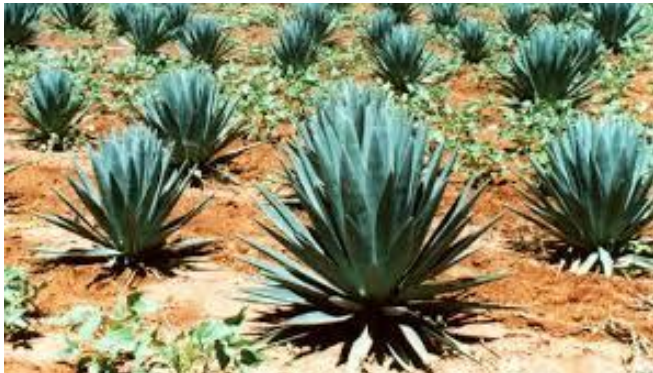
Fig -1 Sisal fiber plant

fiber is one of the most widely used natural fibers and it can be easily harvested. Sisal plant produces over 200-250 leaves during its life time of 7 to 8 years and each leaf contains 1000-1200 fiber bundles.