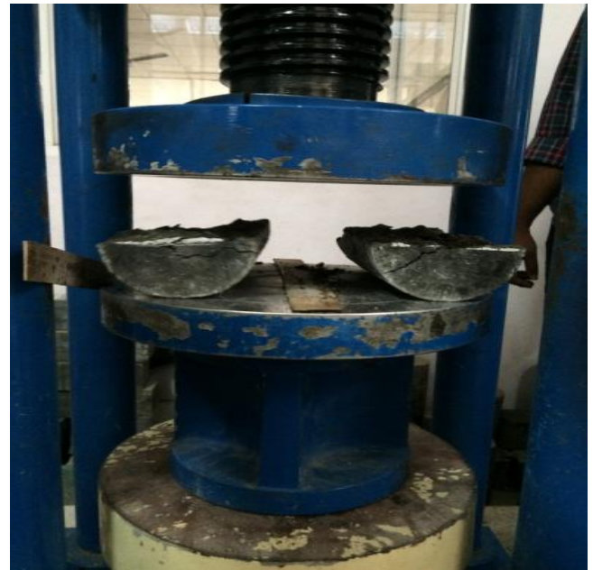
Fig-4 Split tensile strength test

Split tensile strength tests (Fig-4) were carried out on Cylinders of diameter 100 mm and height 200 mm.