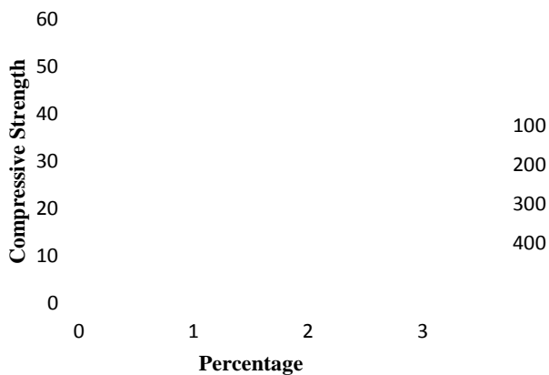
Chart-1: Compressive strength 28th day results