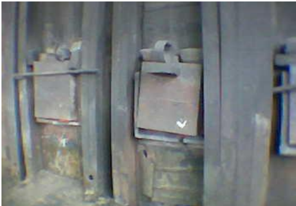
Fig -3: Doors used in the furnace

(b) Doors: The furnaces are provided with a number of inspection doors, besides the charging and extraction doors as shown in Fig 3.