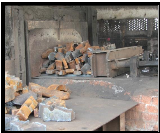
Fig -4: Overloading Hearth of Furnace

(c) Hearth of the furnace: The hearth of the furnace is either under loaded or overloaded as shown in Fig 4. In both the cases excessive energy per unit of production is used. The furnace should be properly designed and its hearth must be properly loaded[4].