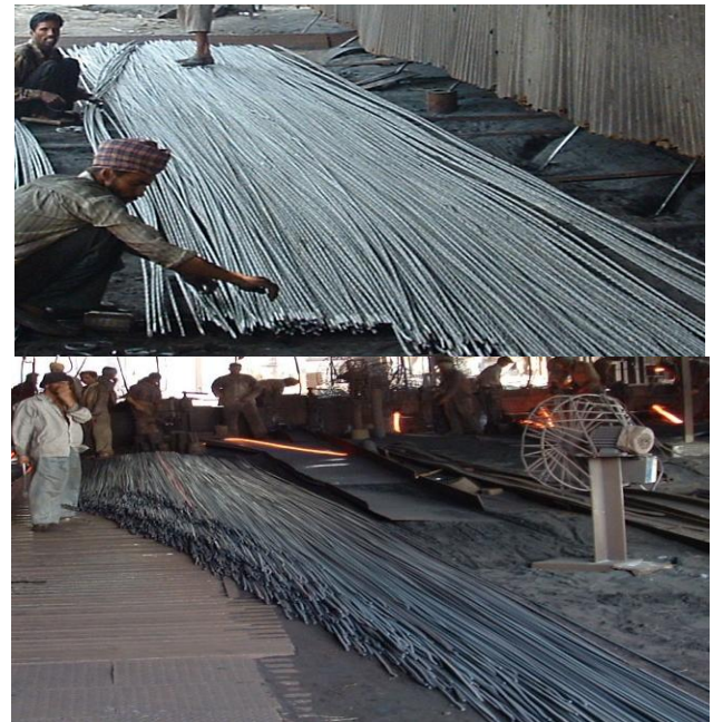
Fig -1: Iron rods of varying diameters, TMT, Patti, and L-strips.

These re-rolling mills are located in India. Clusters are located in Mandi Gobindgarh, Ludhiana & Khanna in Punjab, Calcutta, Bhavnagar in Gujarat, Nagpur & Nasik in Maharashtra and Jaipur in Rajasthan. In Punjab itself there are about 300 re rolling mills having various production capacities mentioned below: