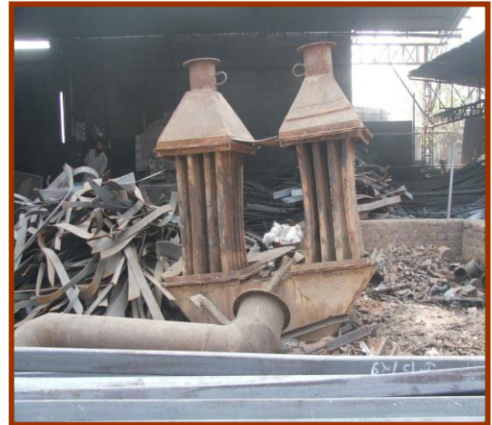
Fig -5: Warped tubes of the recuperator

underground having no provision of cleaning the tubes. This resulted in excessive pressure drop leading to back pressure in the exhaust system .The recuperators installed in the furnaces were not having floating head as a result the tubes get warped as shown in Fig 5. Due to thermal stresses of expansion and contraction.