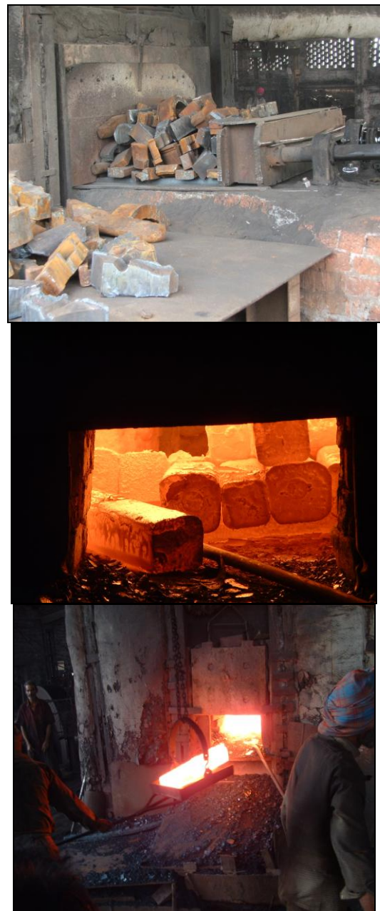
Fig -2: Raw material Charging and Discharging in a Reheating Furnace

(a) Charging and Discharging Method: The furnaces practice back charging and side discharging method. These are shown in Fig 2