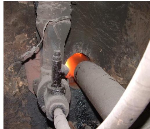
Fig -7 : Hollow pipe used as burner

(e) Burner: A Burner used in pulverized coal fired reheating furnaces is a simple hollow pipe as shown in the Fig 7