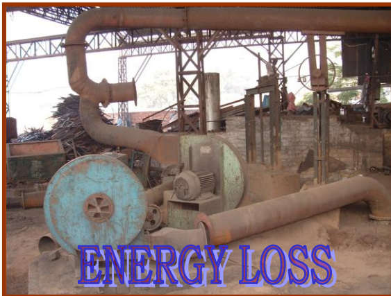
Fig -6: Energy Intensive practices