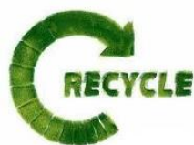
Fig-1: Recycle source