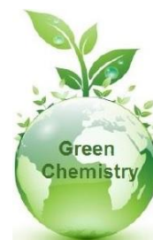
Fig - 2: Green Chemistry