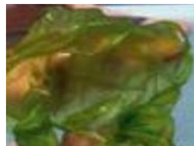
Fig. 6: A piece of Green Algae.