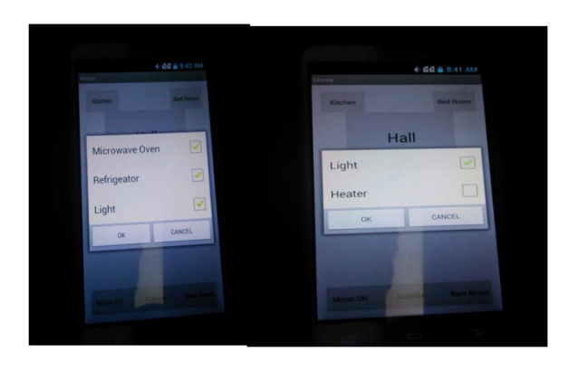
Fig 2: Android application