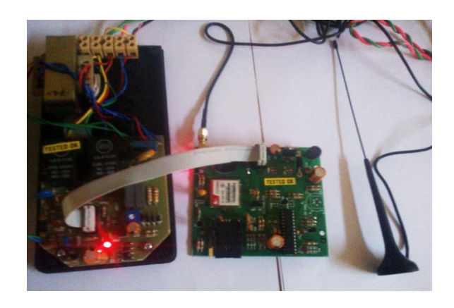
Fig 4: Photo of complete system