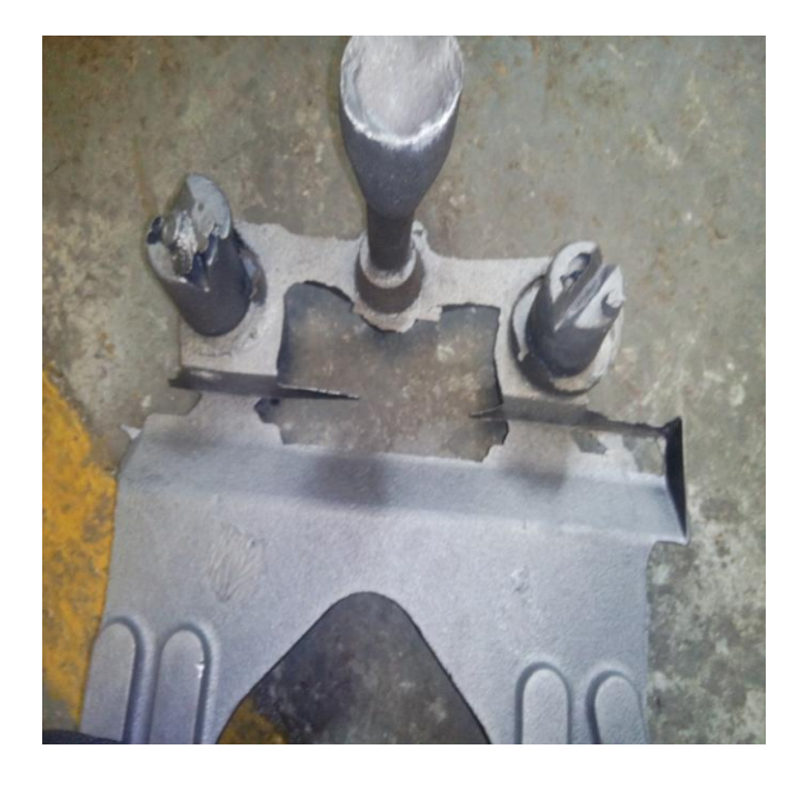
Figure 1:support flywheel housing

According to support fly wheel housing component, it is selected mild steel material, for designing of fixture. Mild steel material is very much use full for designing of a fixture.