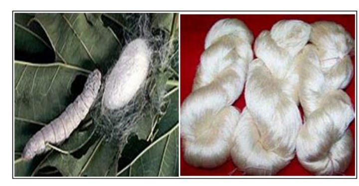
Figure 1. The rearing of silkworms To study the effectiveness of the implementation of Human Resource Development in bilaspur District Silk Board, exposure of employees about new technologies in research field, improvement of subject knowledge etc. Effectiveness of implementation of Human Resource Development programme for the advancement of its employees, enforcement of HRD policies for the progression of its employees [3].

First subsection of this chapter attempts to highlight some important facts and figures of Indian sericulture sector. It presents a clear picture on the requirements, availability, consumption, generation, control and efficiency of sericulture sector in India. Second section identifies the role of sericulture in power generation and the third section provides idea on definition, concept, and theories of Human resource development [2].