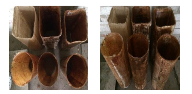
Fig-2: Photograph of FRP Tubes

Each Concrete filled FRP Tubes and Control specimens were tested for their ultimate load carrying capacity. For that the specimens were axially loaded up-to the failure of each specimen. Load testing machine was used for applying the load on the specimens. Machine have the vertical load capacity up-to 15000kN. For measuring the vertical deflection two dial gauges were used as shown in the Fig-3.